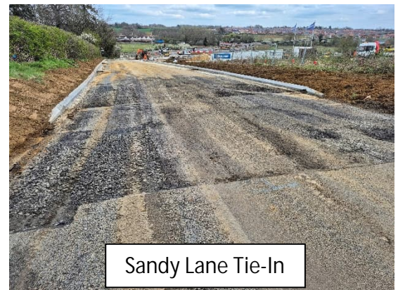
Sandy Lane Tie-In